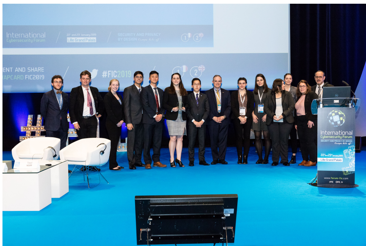
2019 Strategy Challenge award ceremony on the main stage of the FIC 2019 in Lille